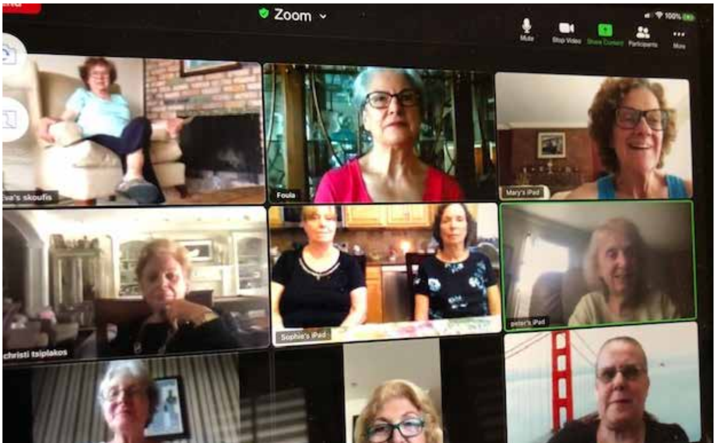
This is a picture of some members of our Zoom meeting –

It's a New Dawn and EOS No.1 is excited to help lead the way!