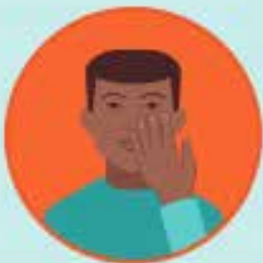
NO FACE TOUCH