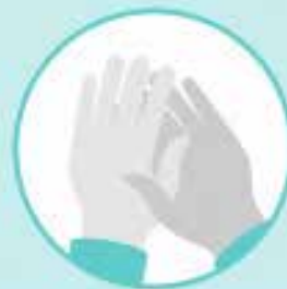
WEAR GLOVES OUTSIDE