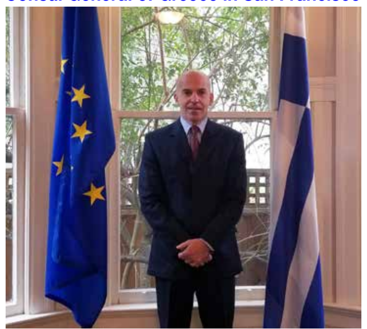
Consul General of Greece in San Francisco Socrates Sourvinos