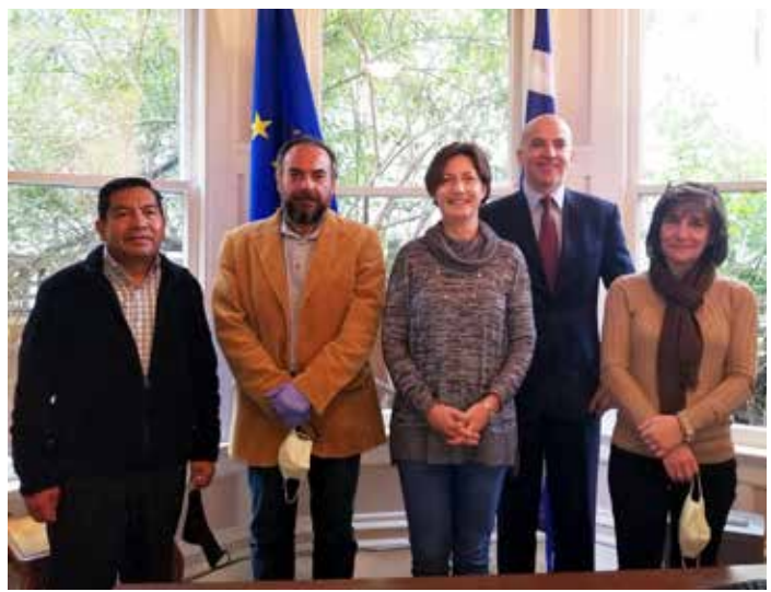
Consul General of Greece in San Francisco Team