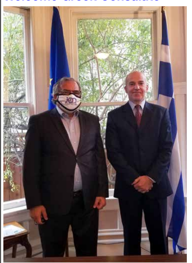
District 21 Governor Mallas and Consul General Sourvinos

I would like to welcome the new assigned Consul General of Greece in San Francisco Socratis Sourvinos.