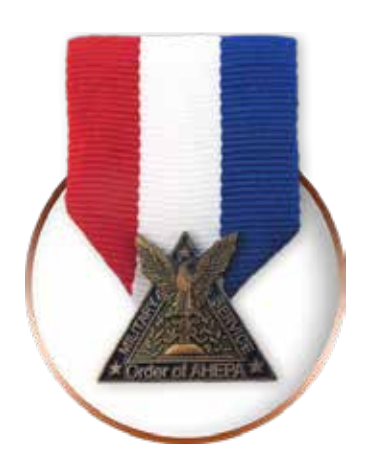
Ahepa Veterans Affairs

Learn more plus you can donate to these National Projects by going to ahepa.org