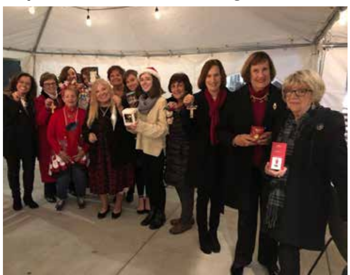
Daphne #29 had their Annual Ornament Exchange on December 4th. A good time was had by all - thank you to the Urania chapter for joining us - you helped to make it a fun evening!