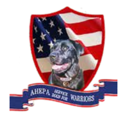
Ahepa Service Dogs for Warriors

Register online at www.ahepaveterans.org. File a copy with your chapter Secretary after registration is complete. Medals are normally shipped in the fall and in time for Veteran's Day celebrations in November.