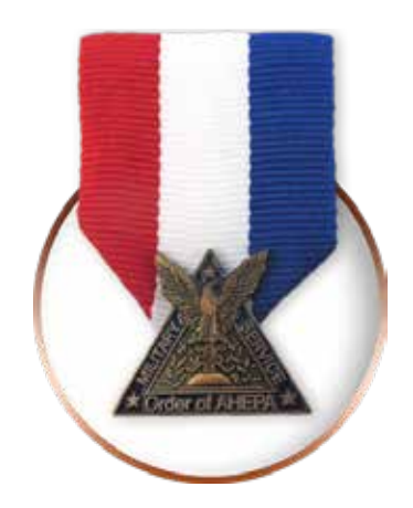
Ahepa Veterans Affairs

Learn more plus you can donate to these National Projects by going to ahepa.org