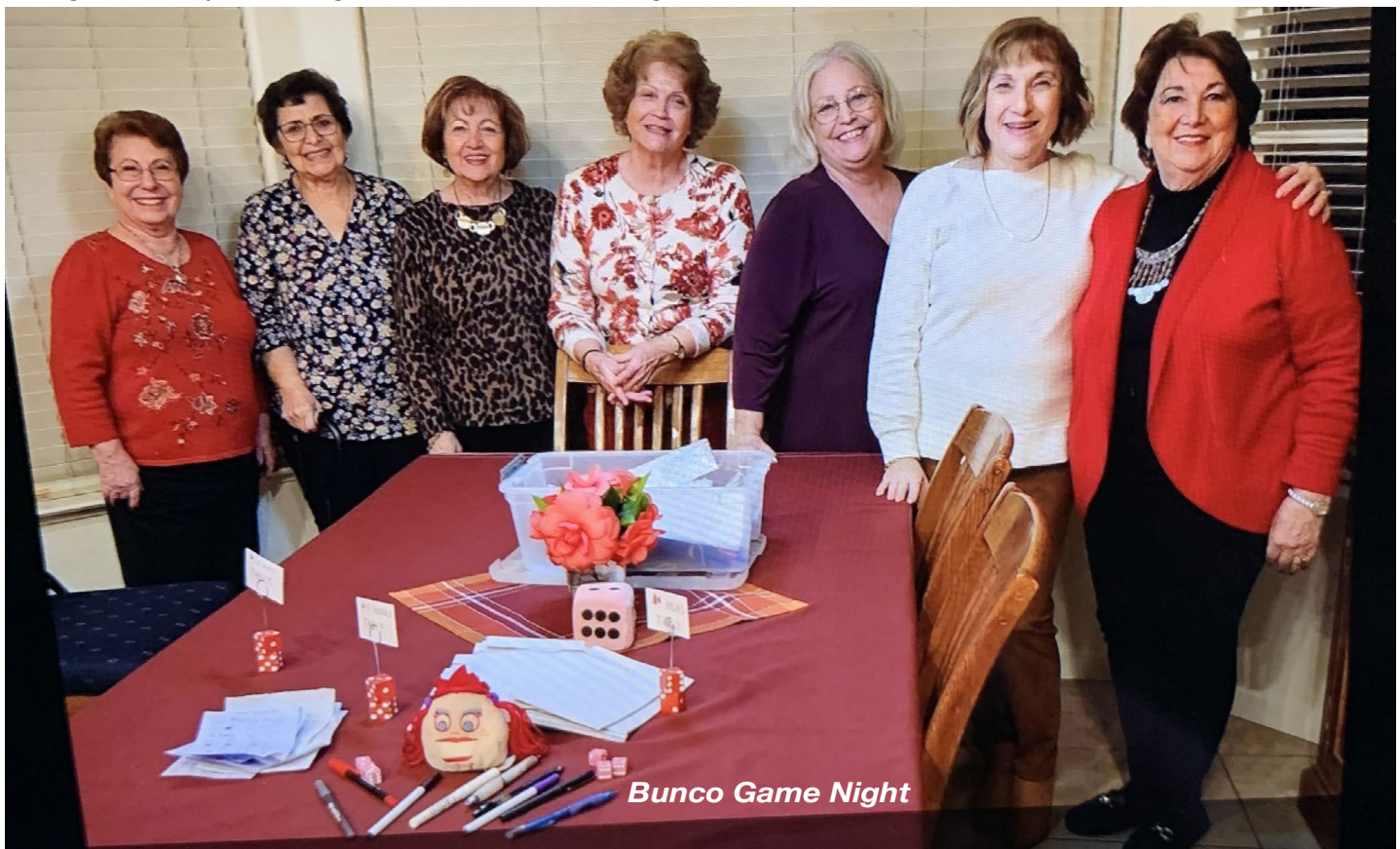
Bunco Game Night

See visitation photos and Mardi Gras flyer on next 2 pages