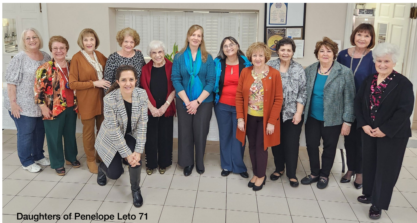
Daughters of Penelope Leto 71