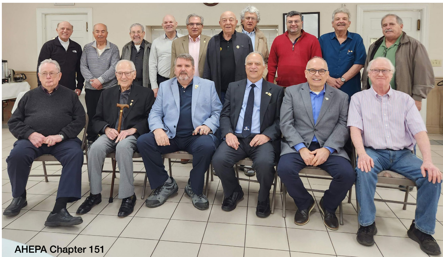
AHEPA Chapter 151