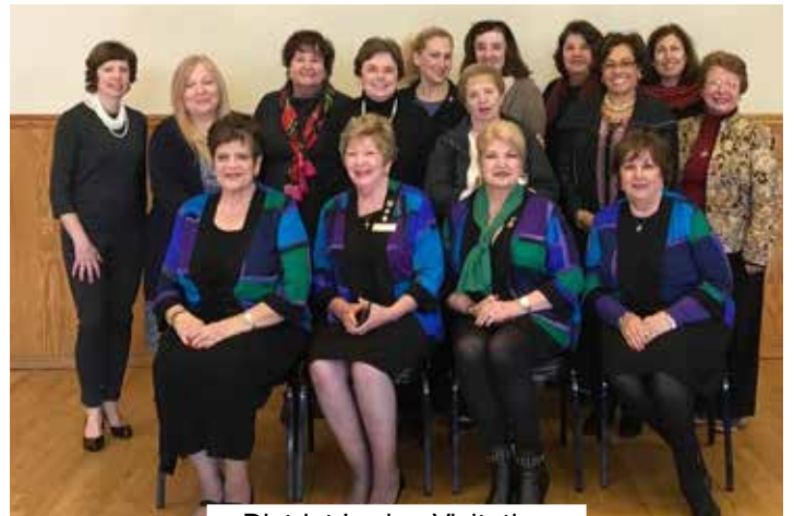
District Lodge Visitation