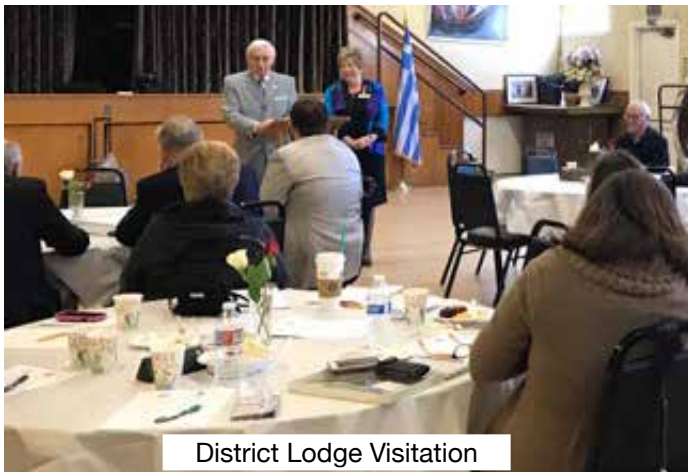
District Lodge Visitation