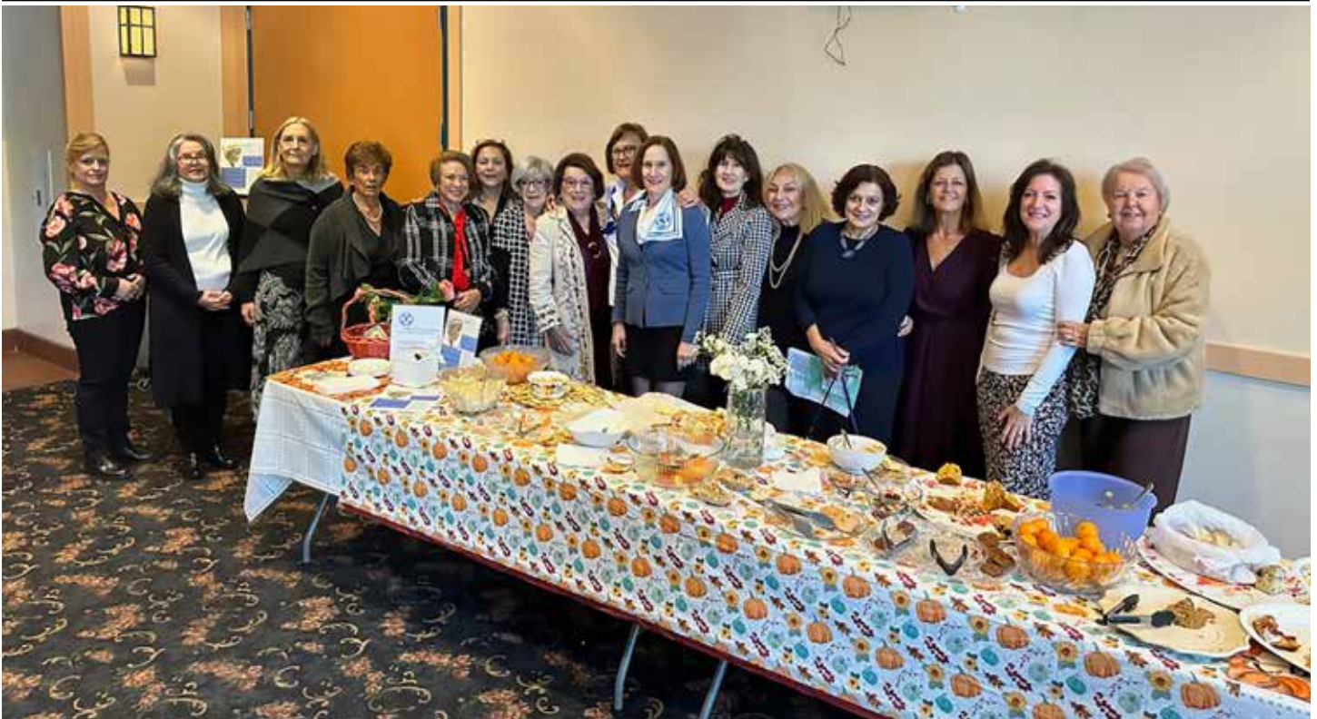
Daughters of Penelope Urania Chapter #290 sponsored a beautiful, fall-themed coffee hour and membership drive at Holy Cross Church in Belmont on November 17 and raised $90 for charities. We were blessed to share our warm and loving sisterhood with our Holy Cross community!