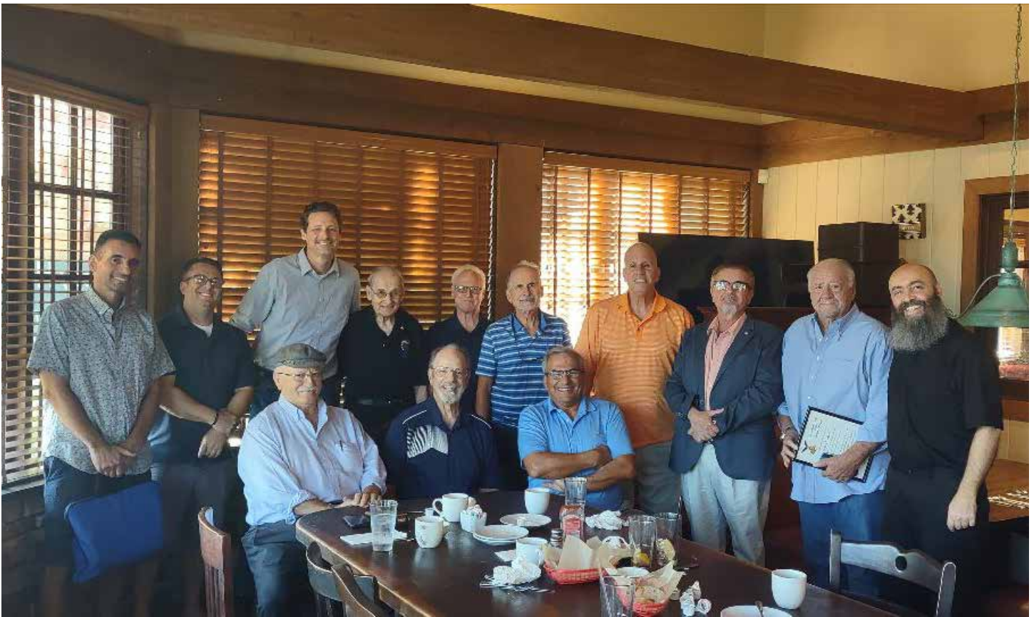
Modesto AHEPA Family and Golden Gate District 21 Lodge Visitation Saturday, October 12, 2024

“Save the Date” 31st Annual All You Eat Crab Feed - Saturday, March 1, 2025