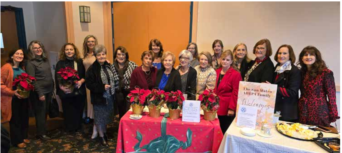
Pointsetta Fundraiser and coffee hour sponsorship on November 24. Oursisters lovingly prepared treats for our Holy Cross community and we raised over $300 selling beautiful Pointsettas for our charities!