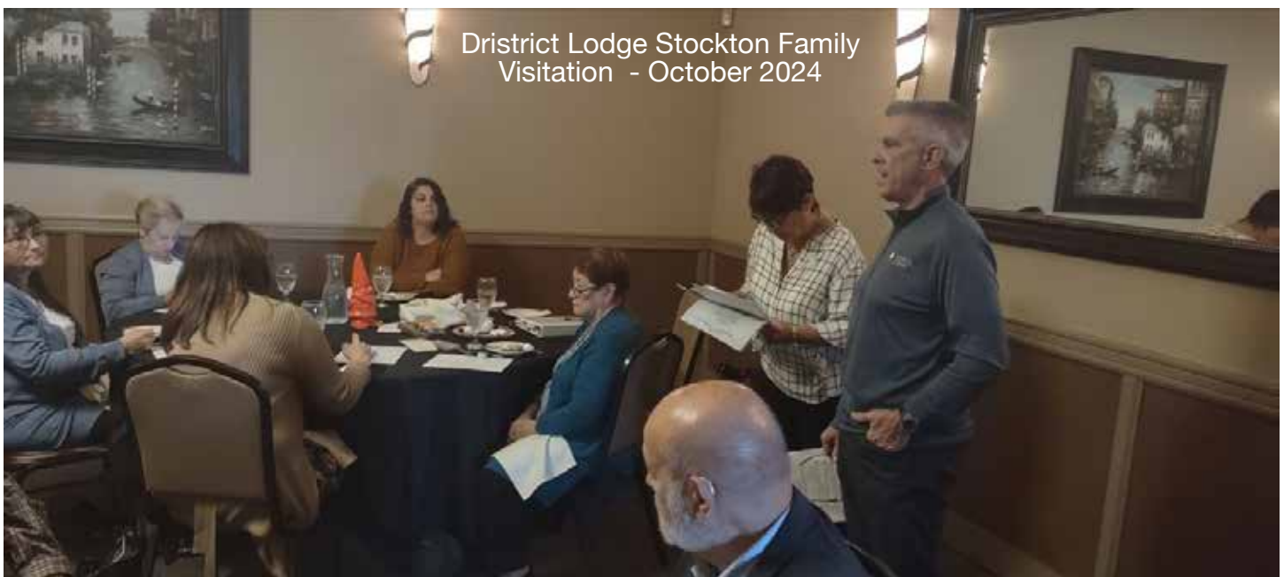
District Lodge Stockton Family Visitation - October 2024

For more info email: ahepa.c251@gmail.com