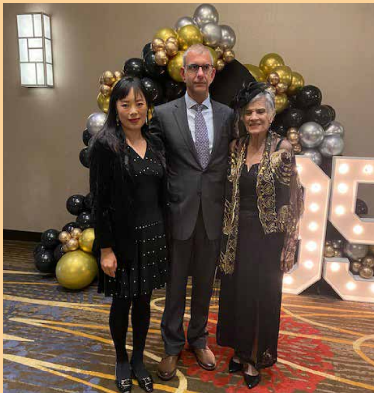
A few of the EOS#1 chapter members at the 95th Anniversary Celebration of the Daughters of Penelope