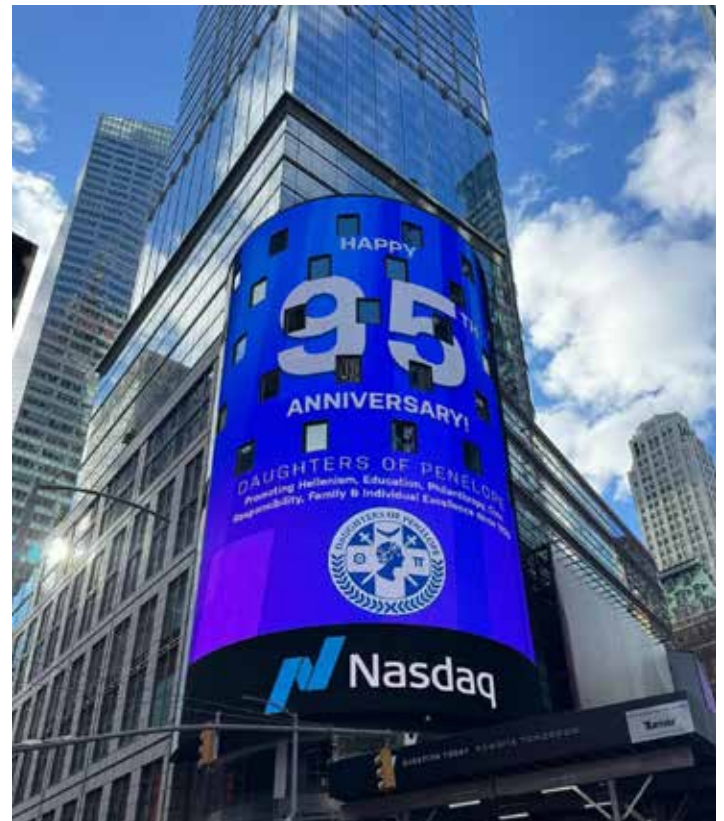
The billboard up in Times Square commemorating The Daughters of Penelope’s milestone.

For those who visited the area, the message could be seen at 1560 Broadway, right above the Pelé store in Duffy Square. The DOP Anniversary message ran for 15 seconds on the 59th minute of every hour for 24 hours on November 16.