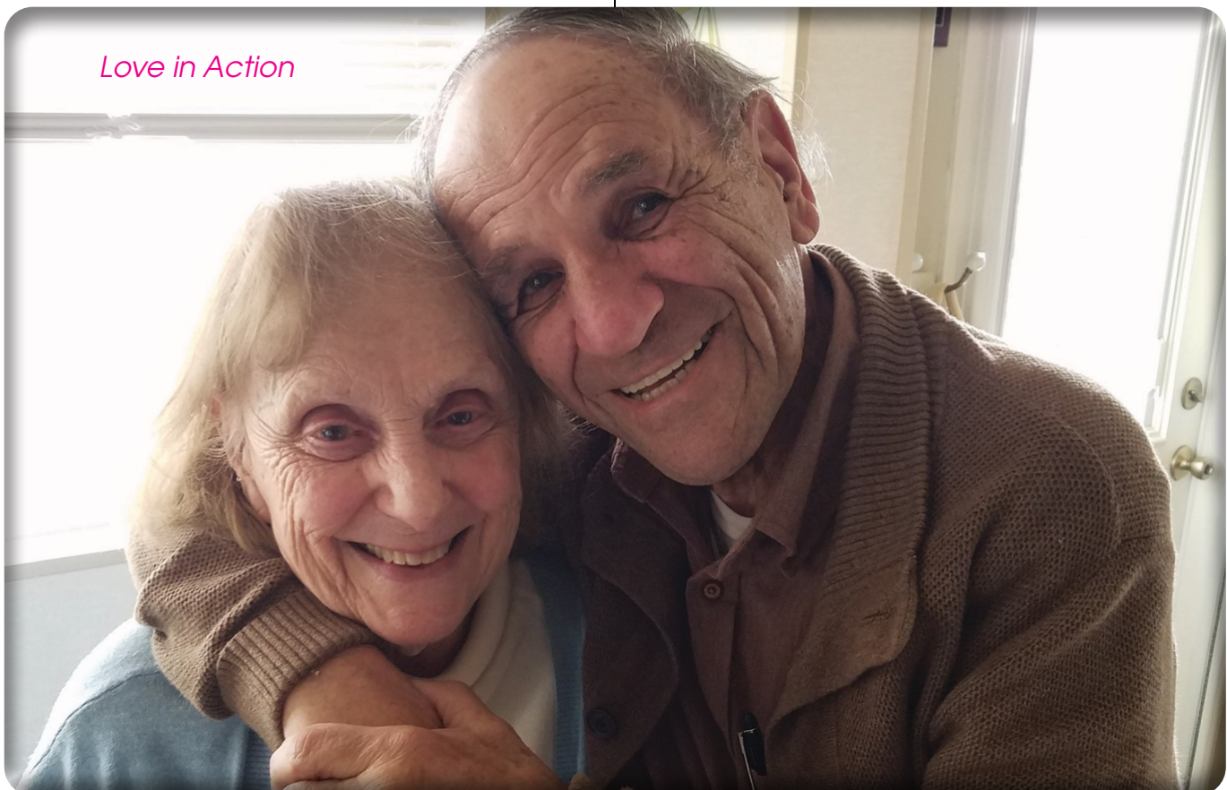
Love in Action