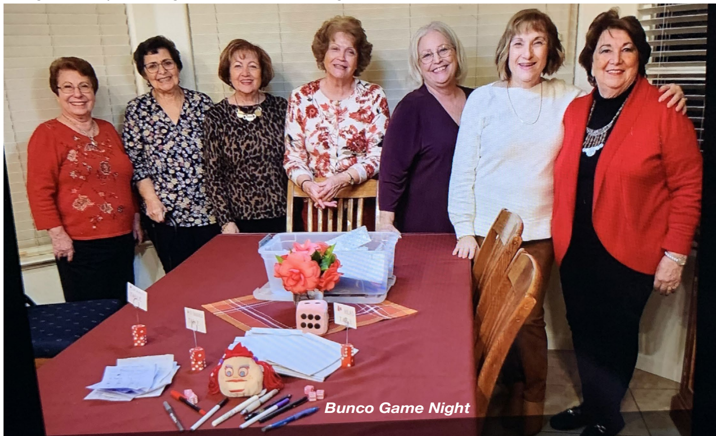
Bunco Game Night

See visitation photos and Mardi Gras flyer on next 2 pages