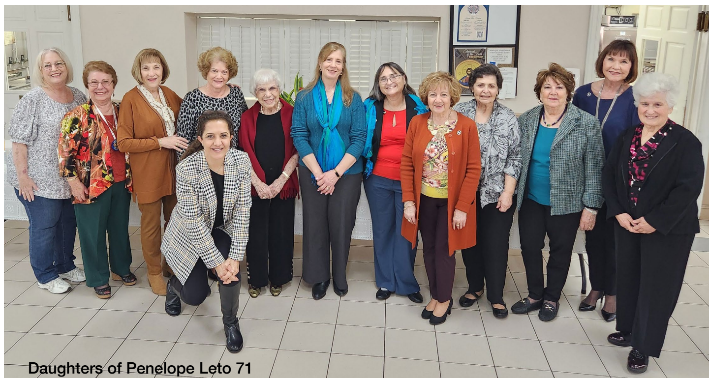
Daughters of Penelope Leto 71