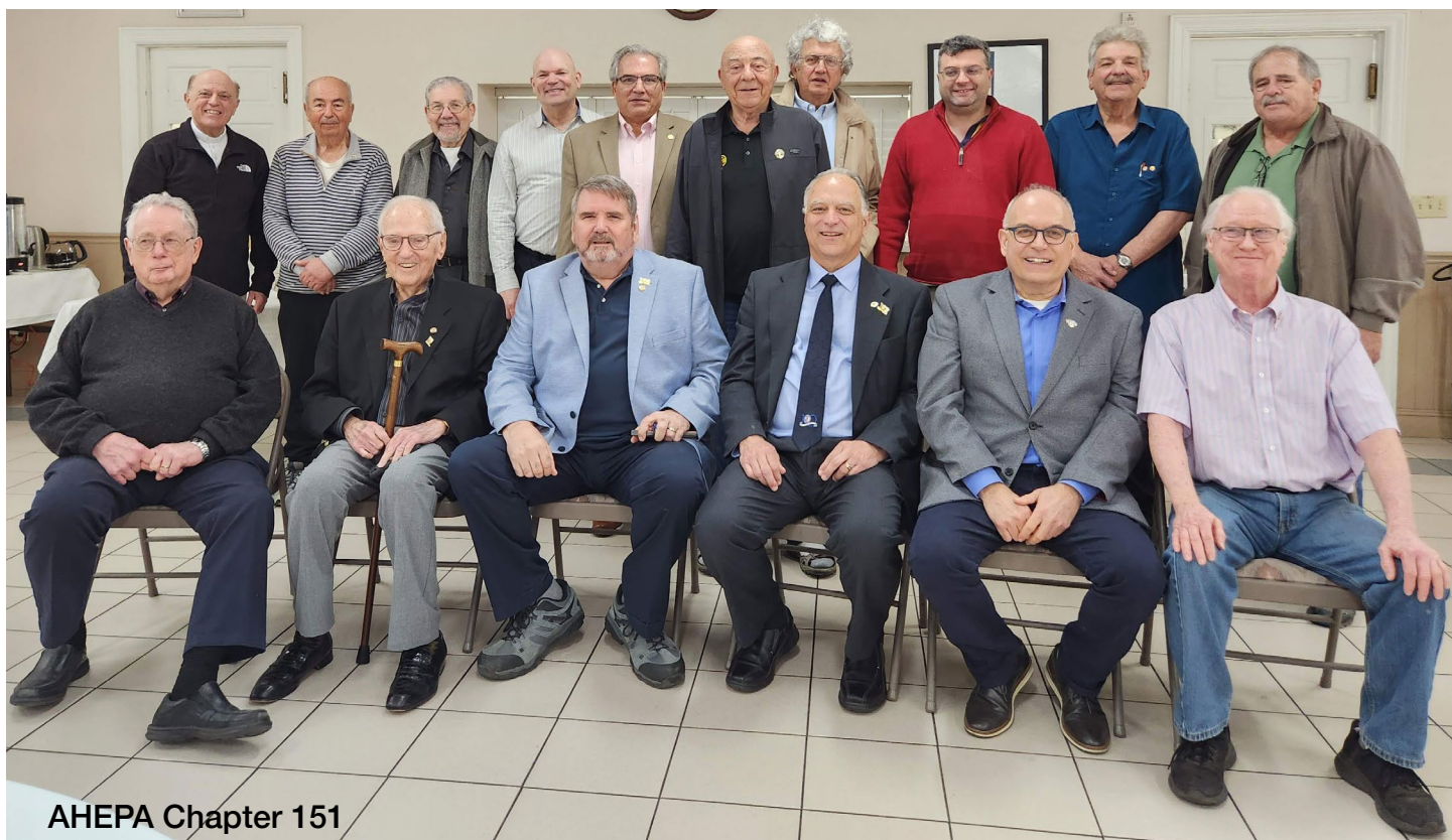
AHEPA Chapter 151